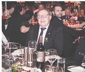
Mayor Robert Rossi