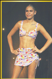
Designer Sol of Eos