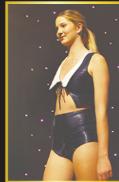
Designer Silver Star Designs