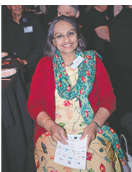
Consul General India, Kajari Biswas