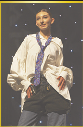
Designers KAARLI with RAG POPUP & FuMoso