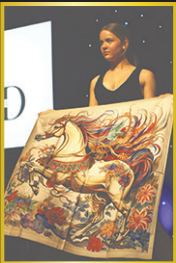
Designer BIRD THE LABEL